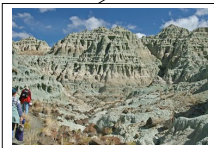
Blue Basin, John Day Fossil Beds