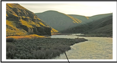
Cottonwood Crossing, John Day River.