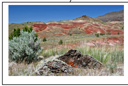
Big Basin area, Dick Creek