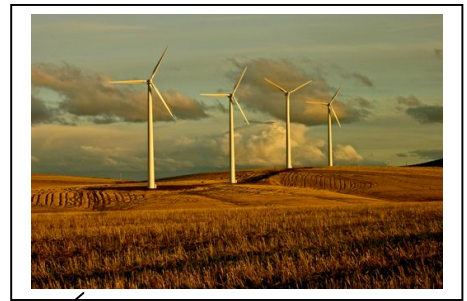
SeaWest Wind Farm, Hwy 208