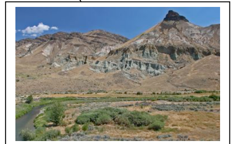
Sheep Rock Unit, and Thomas Condon Center